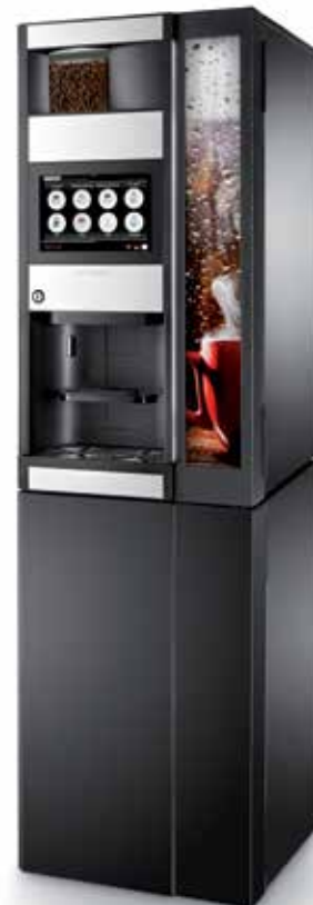
The elegant base stand enhances the design of the machine.